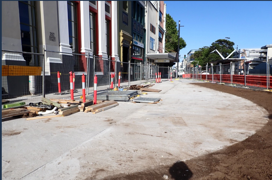
Underway: Stage 9 public domain works East End Newcastle, western side.

City of Newcastle deliver a range of capital works projects to renew and upgrade City Infrastructure. For further information about major projects and works, please see newcastle.nsw.gov.au/works