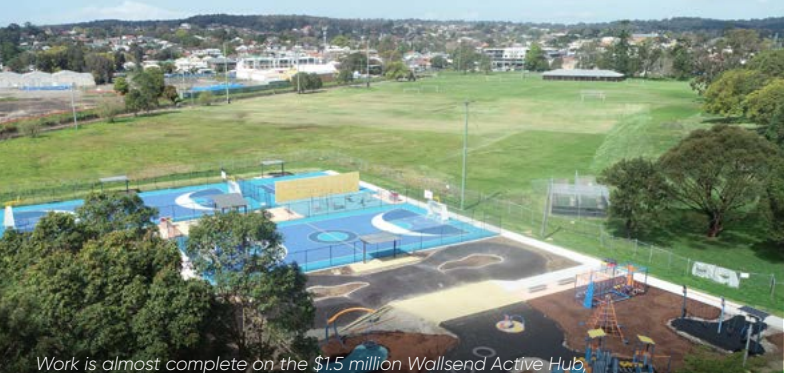
Work is almost complete on the $1.5 million Wallsend A which will be ready to open in November

A barbecue area and toilet facilities will be added to the site during the second stage of the project.