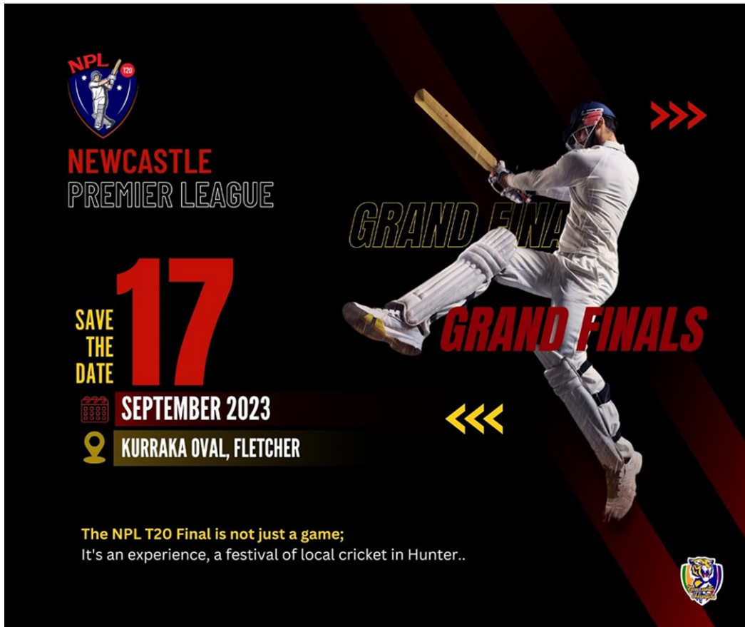
Season 2: Poster, NPL T20