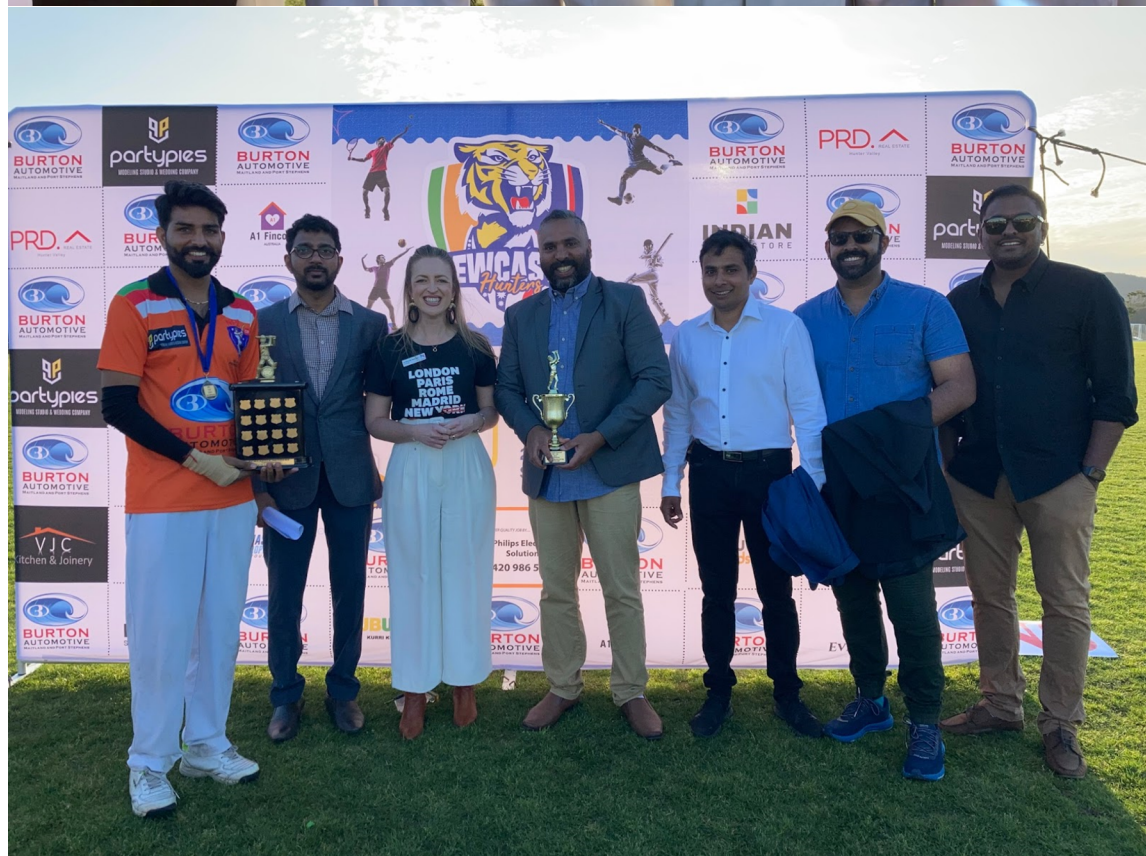
Season 1 NPLT20 Final Presentation, 11 September 2022