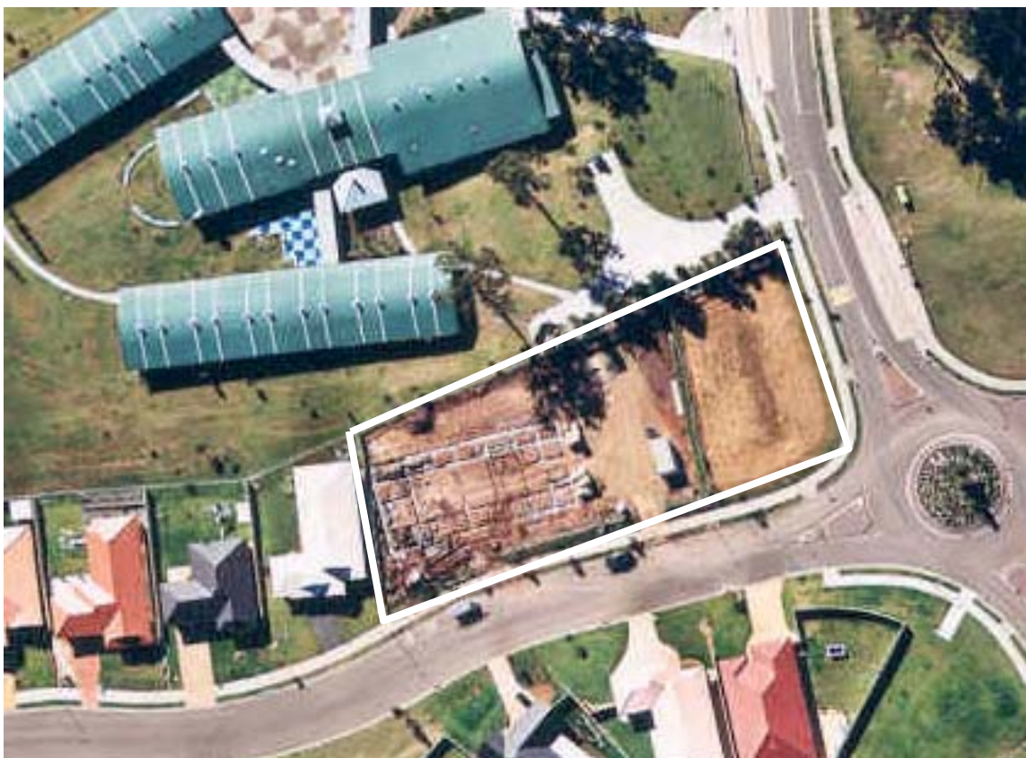
AERIAL PHOTO SHOWING LOCATION OF FACILITY SITE (2000)

This action is ongoing and meets the Parks and Recreation maintenance standards.