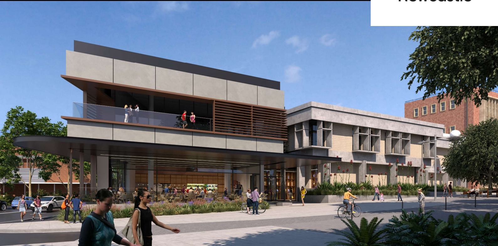
Above: Artist impression