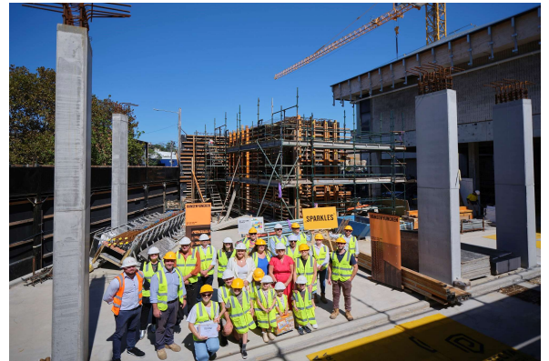
Above: Celebrations at our recent Name the Crane ceremony.