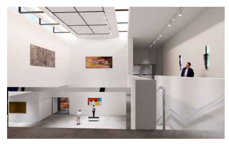
Above: Artist impression, Central atrium ceiling

Our team is so excited to see the design vision for the new spaces come to life on site. One example is the central atrium which is coming along nicely!