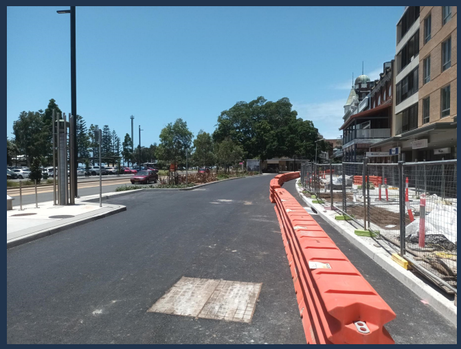
Underway: Stage 9 public domain works East End Newcastle.