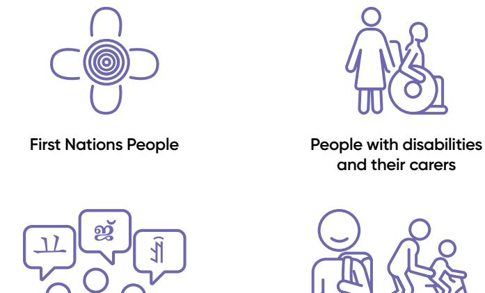
People from a CALD background

We want to hear from all members of our community to make sure that what we deliver for our community is informed, relevant and responsive to community needs. We recognise that some groups are less likely to participate and may face additional barriers or challenges in engaging with us. These groups include: