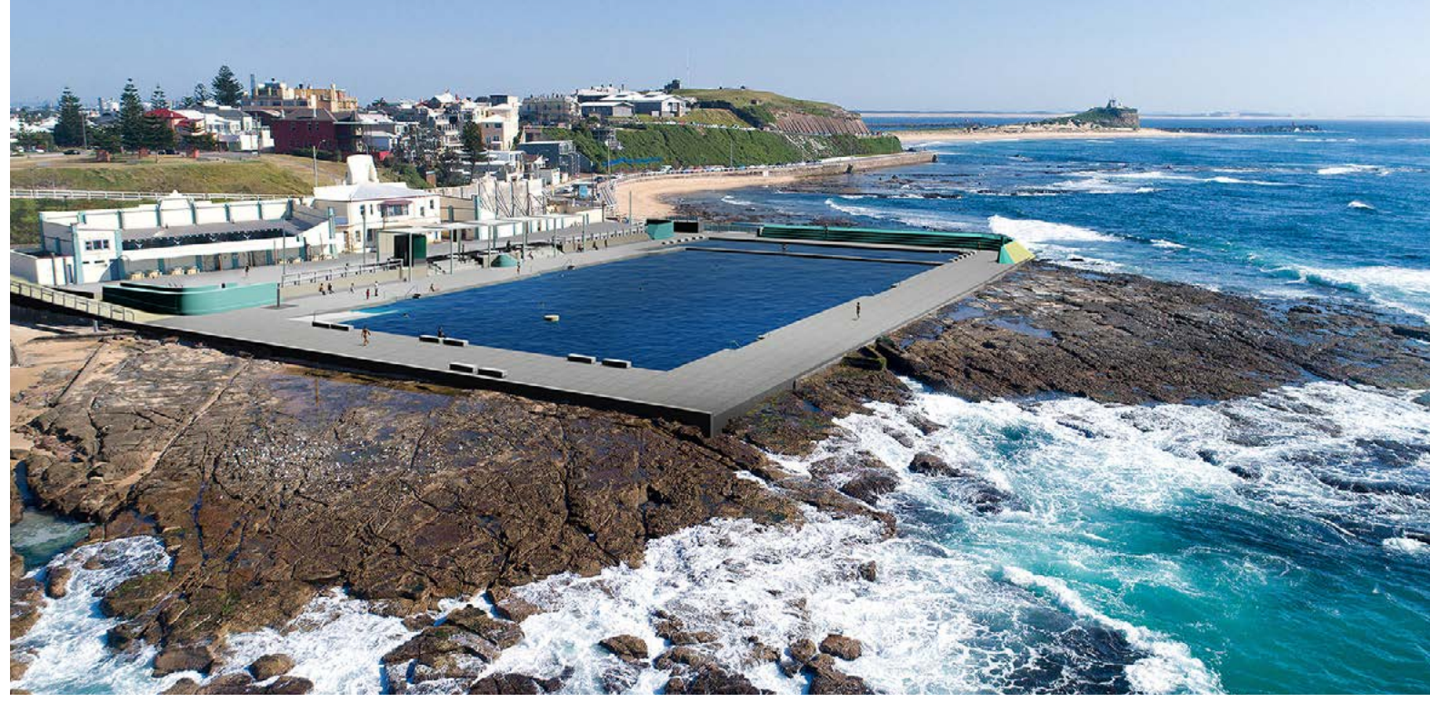
A render showing the final design for the Stage 1 upgrade of Newcastle Ocean Baths.