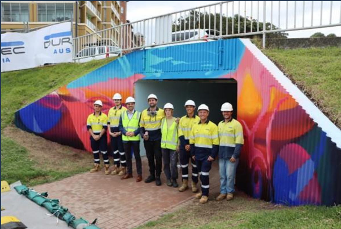
Underway: Mural at subway tunnel at Newcastle Beach.

City of Newcastle deliver a range of capital works projects to renew and upgrade city infrastructure. For further information about major projects and works, please see newcastle.nsw.gov.au/works