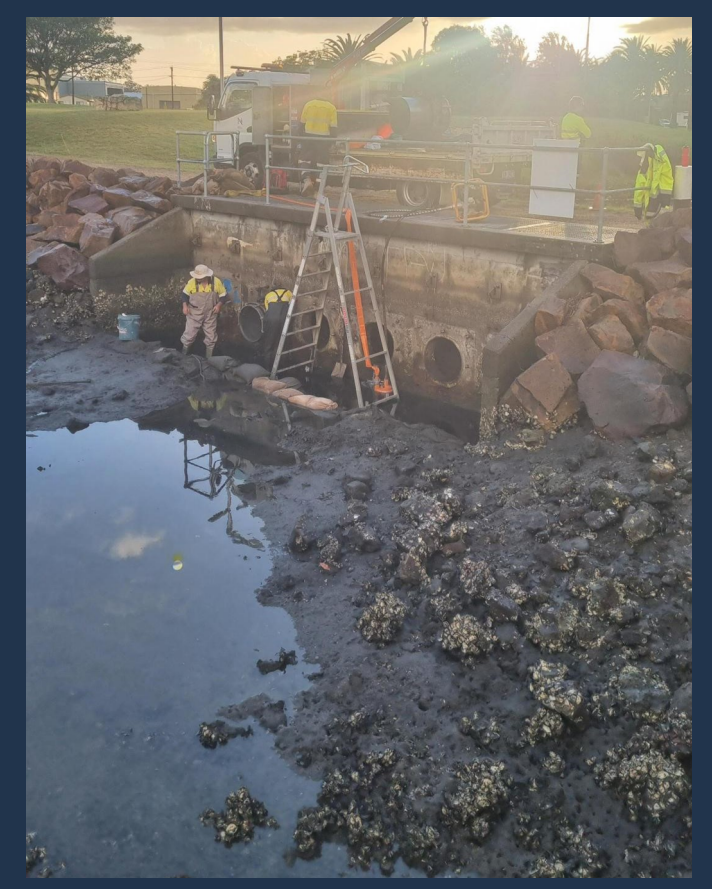
Underway: Tide gate rehabilitation Hargrave Street Carrington.