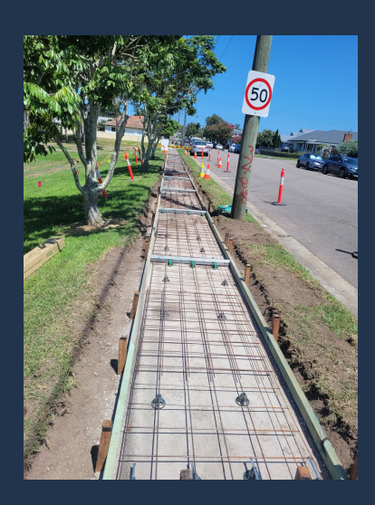
Underway: Footpath Construction at Orchardtown Road between Novocastrian Park and Watson St.