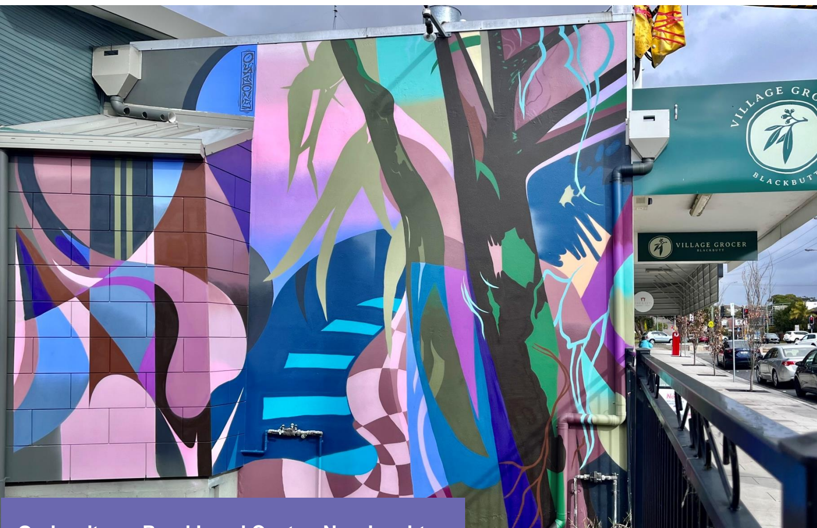
Orchardtown Road Local Centre, New Lambton